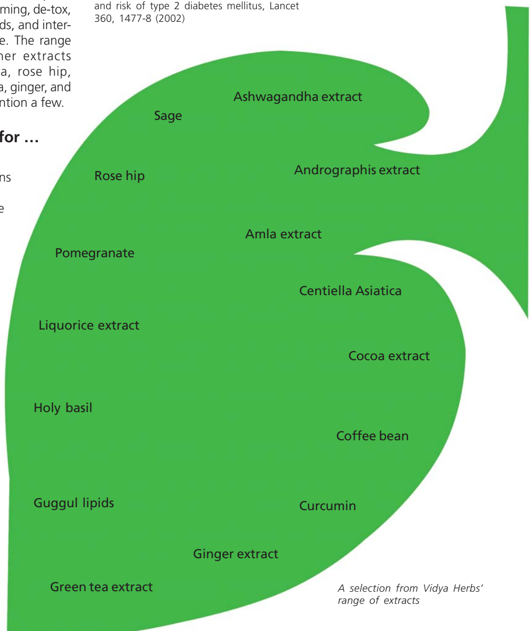
A selection from Vidya Herbs' range of extracts